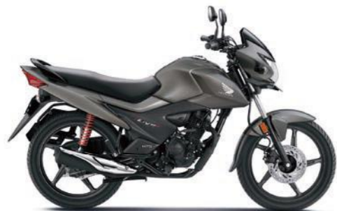
MATT CRUST METALLIC